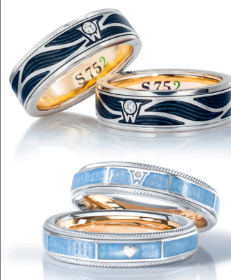
S-752 and Summer Love rings