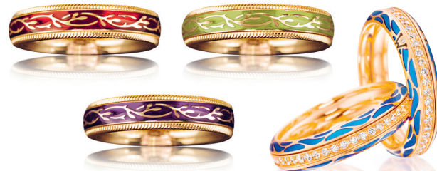
Chili Fantasy, Pistachio Fantasy, Violet Fantasy and Genuine Delight. Endless Ocean rings.