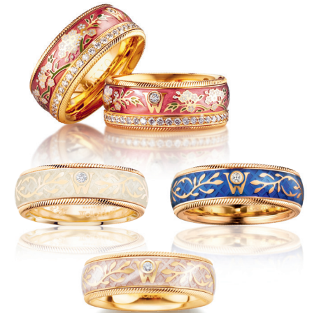
These rings are worn by the women in the Atsuko family – because the rings and their engravings reflect values that are important to them.

We bought them that same day: my mother the Forget-Me-Not model, my sister the Pearl model and my nephew's wife the Tokyo ring decorated with cherry blossoms –